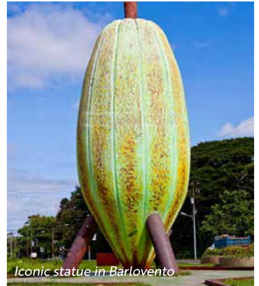
Iconic statue in Barlovento

Milk, lactose, soya, soya oil, Fructose. Suitable for vegetarians and vegans.