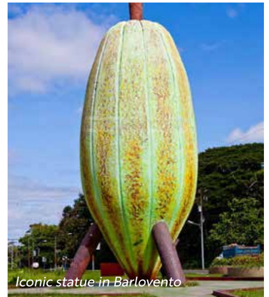
Iconic statue in Barlovento

Milk, lactose, soya, soya oil, Fructose. Suitable for vegetarians and vegans.